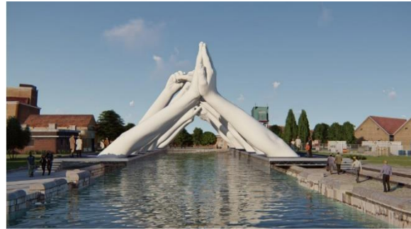
The new work in Venice.

The Venice Biennale International Art Exhibition is a bi-annual visual art exhibition that attracts half a million people to the Italian city.