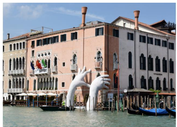
'Support' by Lorenzo Quinn highlights how climate change affects Venice.

In 2017, Venice was home to another of the artist's incredible installations called 'Support,' which also formed part of the Biennale. On that occasion, the artist hoped that his artwork would help to spotlight the effects of climate change on World Heritage Sites .